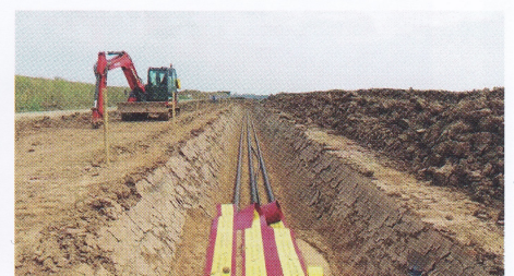
Visuals of SPR Bramford EA1 Substation (nearing completion), an HVDC Interconnector (NG Kent to Belgium link) and typical HVAC cable trench, (4 of these needed for access to the Friston site)